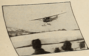
Ⓒ "Duke" Schiller lands. Ray's camera got everything.