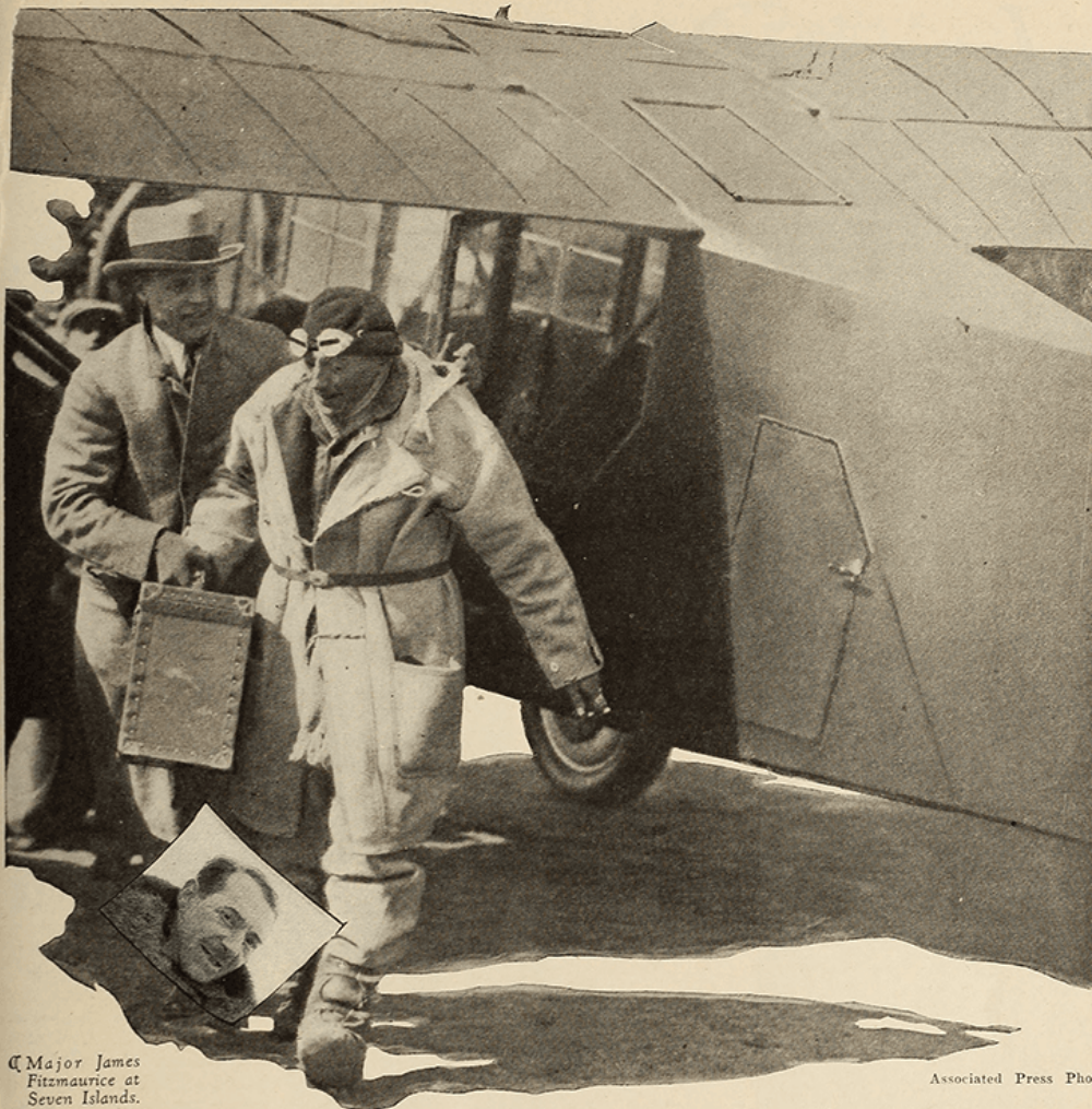
Ⓒ Major James Fitzmaurice at Seven Islands.