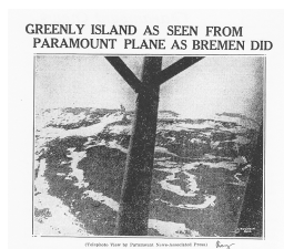
Figure 4: Newspaper clipping of the big story. Photo, adapted from Ray's newsreel, shows Greenly Island as taken from the Fairchild. Note the credit lines at the bottom.

I knew they thought we were there to rescue them instead of just making pictures, and we sure as hell didn't tell them any different. We put on a great show. Eddie and I greeted them with open arms as rescuers. But the whole idea was strictly pictures, our life's blood.